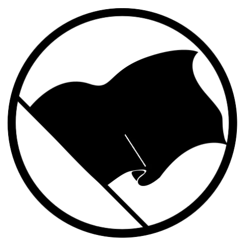
Support All Freedom Fighters!

— The Effrenatum core editing/publishing team